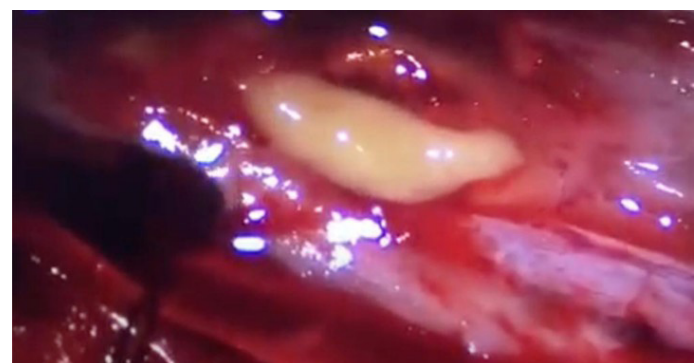
Figure 3. Microsurgical view presenting purulent secretions after myelotomy.