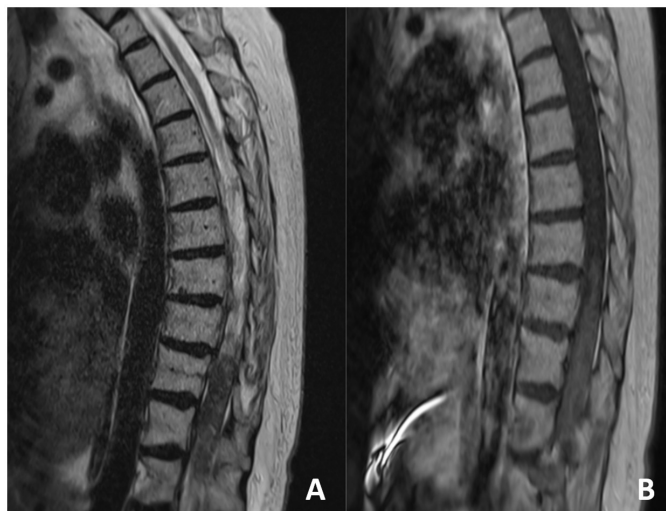
Figure 1. Magnetic resonance imaging of thoracic spine. (A) T2, showing hypointense infiltrating contrast-mass centered in the medullary canal between T8 and L1; (B) T1. Note the presence of the intrathecal pump catheter.

Microsurgical resection of the lesion was indicated. We performed T10-L1 laminectomy, flavectomy, and durotomy at the same level. After durotomy, multiple yellow lesions were seen through the spine. After myelotomy, purulent secretions were immediately drained. A sample of the material was collected for analysis. After drainage of all visible purulent foci, hermetic closing was performed. Finally, the morphine pump located in the abdominal region was removed (Figures 2 and 3).