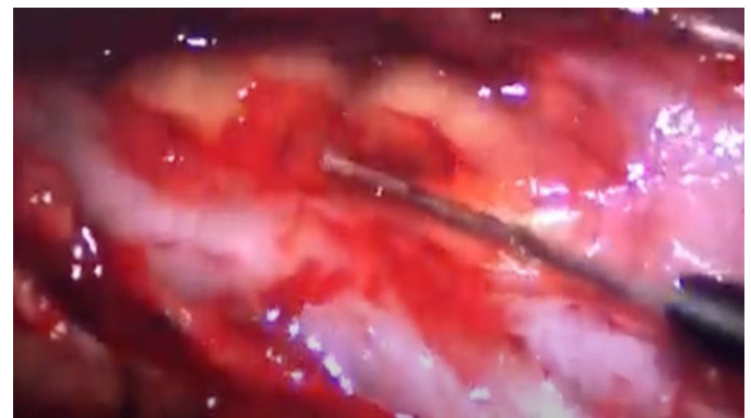
Figure 2. Microsurgical view presenting purulent foci over the medulla.

Intramedullary spinal cord abscess (ISCA) is a rare neurological entity in spinal cord infection with more than 140 cases described in the literature since its first description by Hart in 1830. These